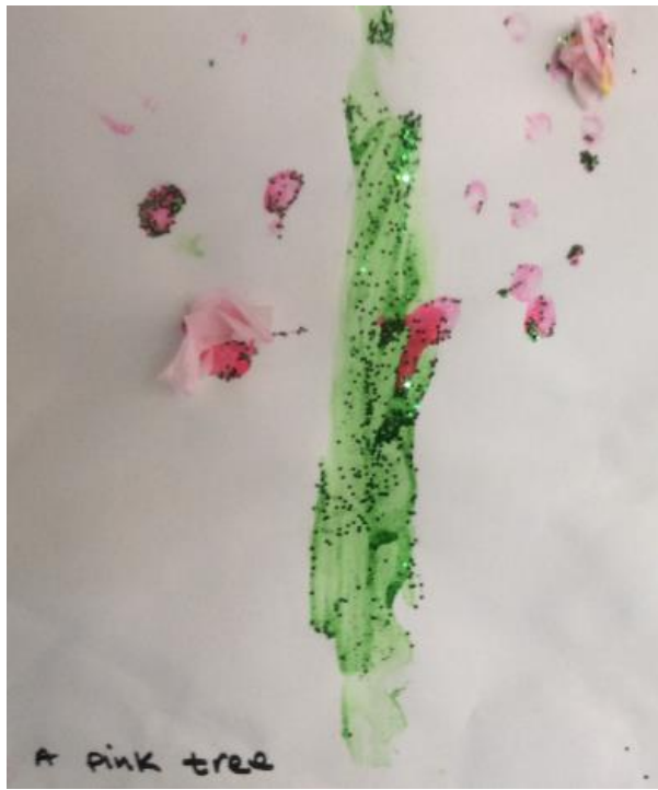
A pink tree